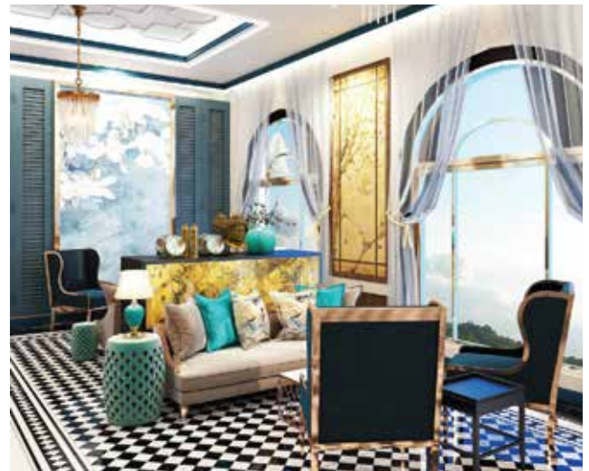
Interior design CONTINENTAL SAIGON HOTEL Student: Pham Ngoc Dang Chau