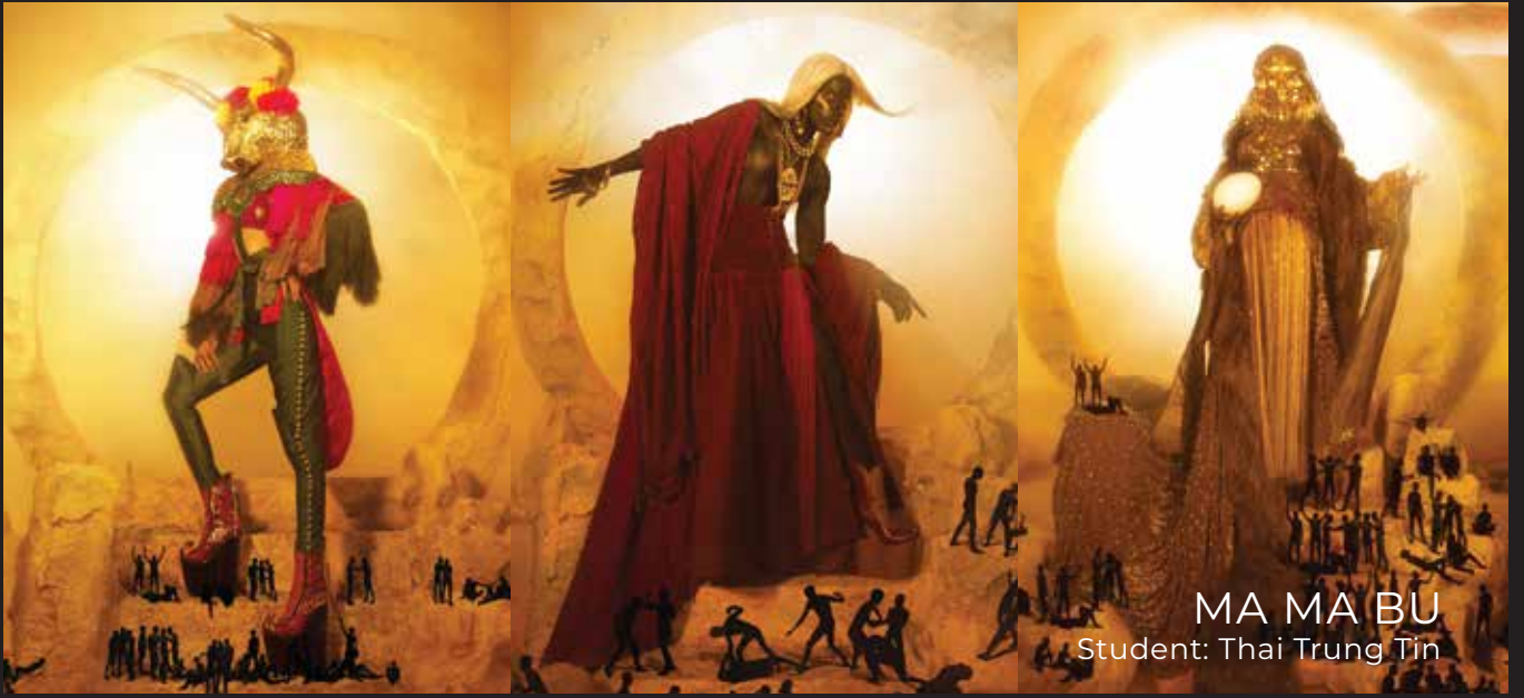
MA MA BU